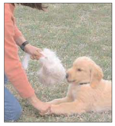
Photo 8: She opens her mouth immediately when I squeeze her foot, and I praise her for dropping on command!

Start getting your puppy used to being groomed. Teaching your puppy to be still while you brush him is easier if you place him on a table. If you don't have a grooming table, stand him on your picnic table or place a towel or other non skid material on top of your washer or dryer. Being elevated is often just intimidating enough for your puppy to be willing to stand still! Hold your puppy by the collar with one hand while you practice brushing him with your other hand. It is more important that the puppy hold still than that you effectively brush his whole body, so keep your sessions short. While he's on the table, lift up each foot and look at