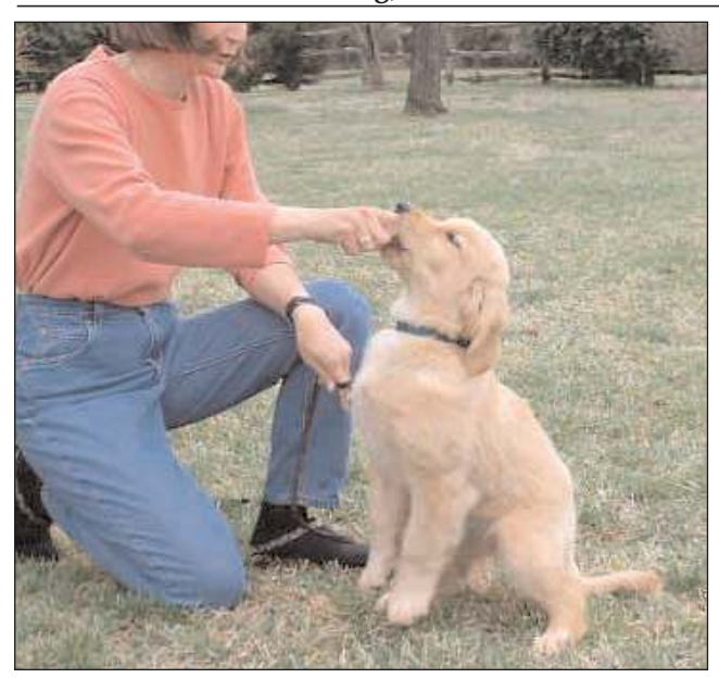
Photo 2: Cinda sits for the treat. The treat is a bit too high, as her front feet come off the ground to try to get it from me.

(10-15 feet) around the house or yard, or whenever you are in a situation where he might not allow you to catch him. First, this will allow him to grow accustomed to being on a leash, and it will also afford you the ability to catch him if he starts to run from you.