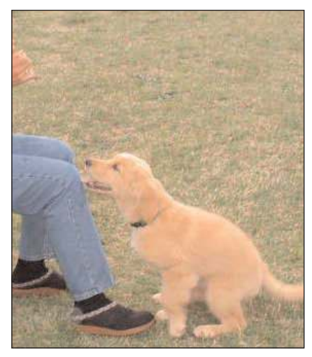
Photo 6: Feeling the pressure on her foot, she puts all four feet back on the ground!