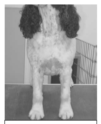
Figure 4. Shaved Shelby from the front

Some people have been heard to say that our standard contains a contradiction on topline, but as the person who chaired the last standard revision process, I am here to tell you that is not the case. It says, " The portion of the topline from withers to tail is firm and slopes very gently ", and also, " The back is straight, strong and essentially level ". How can that be? Easy. This can be clearly seen in Figures 1, 2 and 3. The withers are slightly higher than the set on of the tail, yet the actual back (the section that begins <u>behind the withers and</u> continues to the point where the croup begins, is essentially level. Since the withers are the highest point over the shoulders, and the set of the tail follows a gently sloping croup, the ENTIRE topline from withers to tail slopes gently, but the backline remains level. Backlines that slope sharply indicate upright shoulders, and those that sag between withers and croup show incorrect structure and weakness.