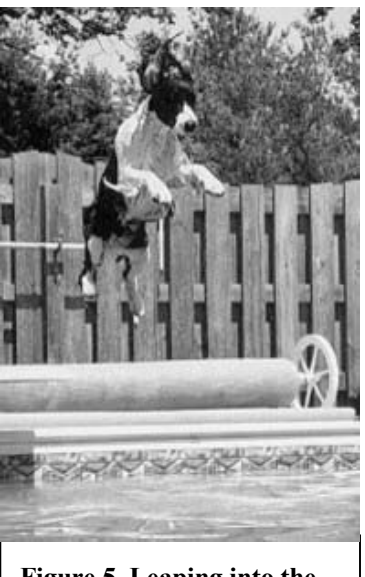
Figure 5. Leaping into the pool-off the diving board!

to the ground through all phases of her stride (to conserve energy). She covers a maximum amount of ground with a minimum amount of effort-exactly the